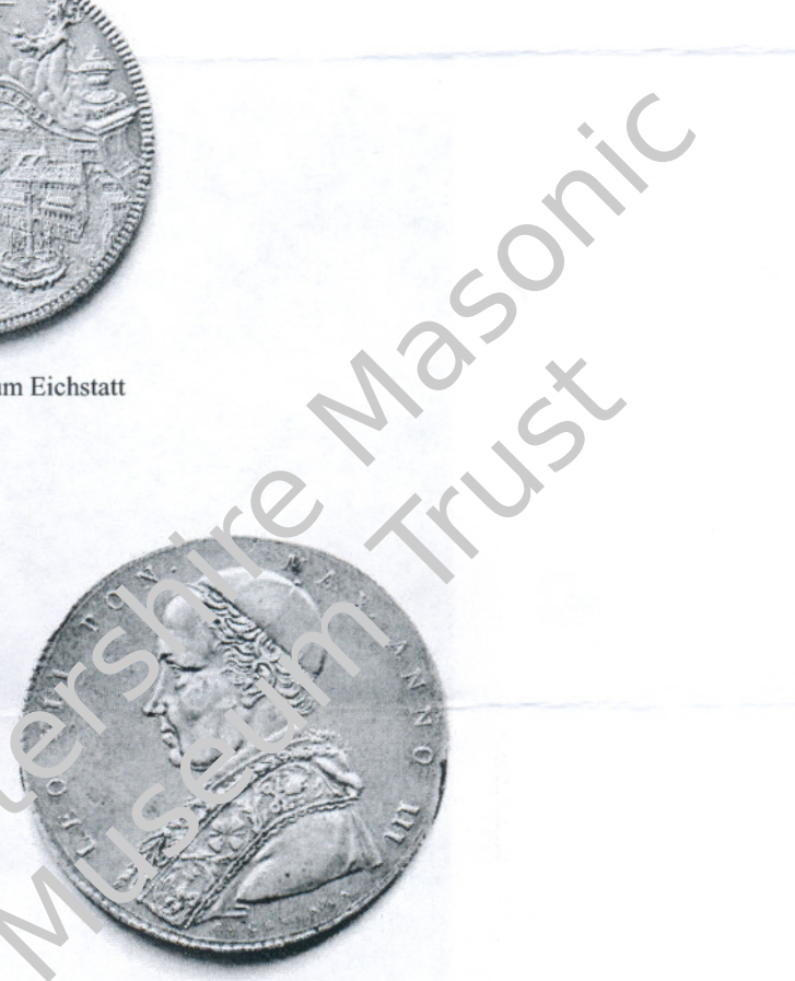
Vatikan LIO XII - SELTEN 1 Scudo 1826