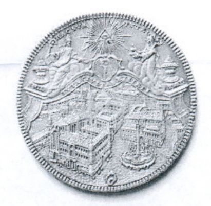
1 Taler 1781 Bistum Eichstatt